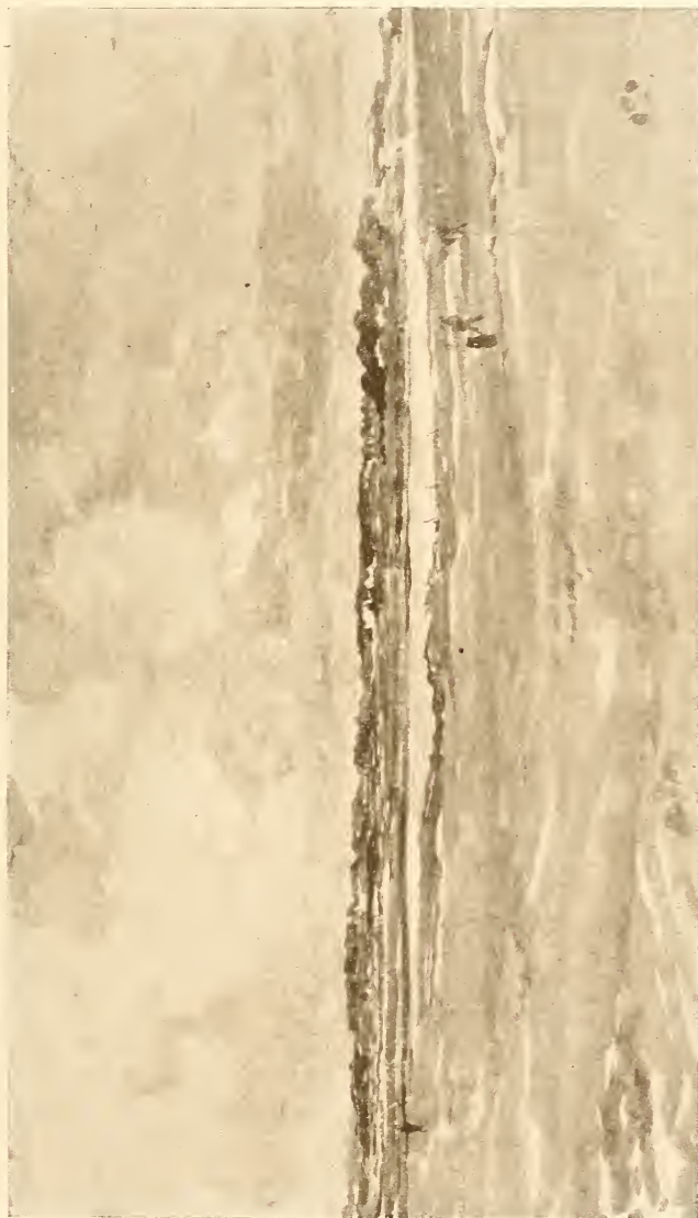
Gray and Silver. "THE GOLF LINKS"—DUBLIN. (Water-Colour.)